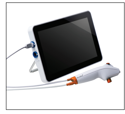
Ambu aScope 4 Broncho Large and Ambu aView 2 Advance