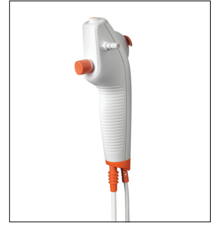
The ergonomic and lightweight handle is designed to give you a firm and comfortable grip