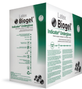
Biogel® Indicator® Underglove