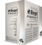
Biogel® PI UltraTouch® G