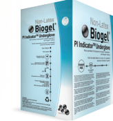
Biogel® PI Indicator® Underglove