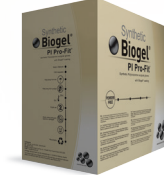
Biogel® PI Pro-Fit®