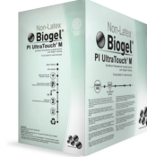
Biogel® PI UltraTouch® M