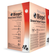
Biogel® Skinsense® Indicator® Underglove