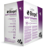
Biogel® Optifit® Orthopaedic